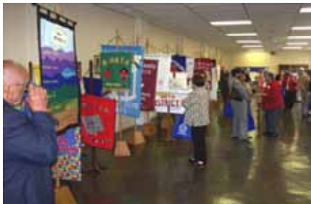
Unit and District Banners