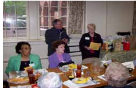
Lunch on Monday