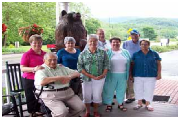
BRE members at Swinging Bridge Restaurant

The Botetourt Retired Educators held its final meeting of the 2011-2012 year at the Blue Ridge Vineyard in Eagle Rock, Virginia. The winery is owned by a retired Botetourt County educator and her husband. A catered picnic lunch was enjoyed by all in attendance, and officers for the next two years were installed at the meeting. In June a group of BRE members went to Paint Bank, Virginia, to have lunch at the Swinging Bridge Restaurant. This restaurant is known for its buffalo burgers and the swinging bridge that crosses the length of the restaurant.