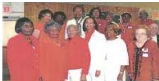
Petersburg/Prince George Unit Chorale