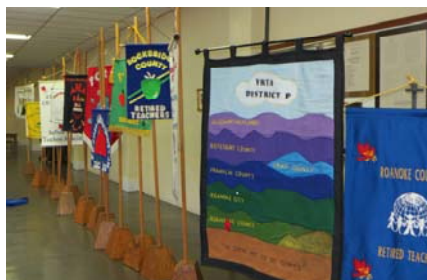
Banners on display at Fall 2013 VRTA Meeting.

Sunday 7:00pm — Executive Committee Meeting Monday 8:am — Breakfast 9:00am — 11:30am — Registration 9:30am — Board of Directors meeting 11:45am — Lunch 12:50pm — Virginia Retirement System Assembly 2:00pm — Workshop Sessions 6:00pm — Dinner 7:15pm — Entertainment 8:30pm — Popcorn and Bingo Tuesday 8:00am — Breakfast 9:00am — Delegate Assembly and Keynote Speaker 12.00noon — Lunch