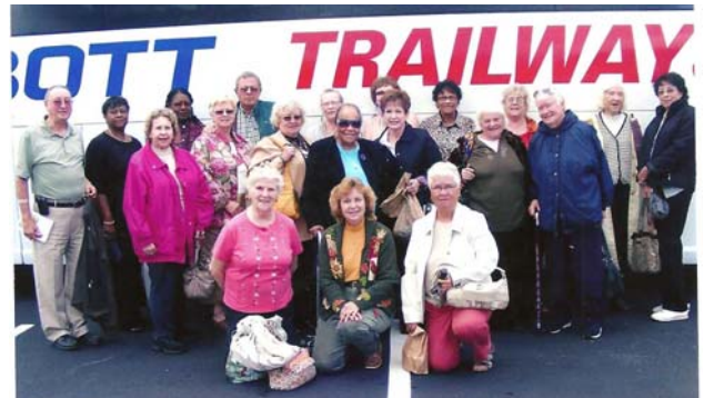
Trip to Michie Tavern

At our December meeting, we had a luncheon at the Tanglewood Holiday Inn, and were entertained by the very talented "Hands For God Puppet Ministry." Many cans of soup were brought by our members to the meeting to contribute to the AARP program "Soup For Seniors." Also at our September and December meetings, silent auctions were held. All proceeds from the auctions are given to our Scholarship Fund for future teachers.